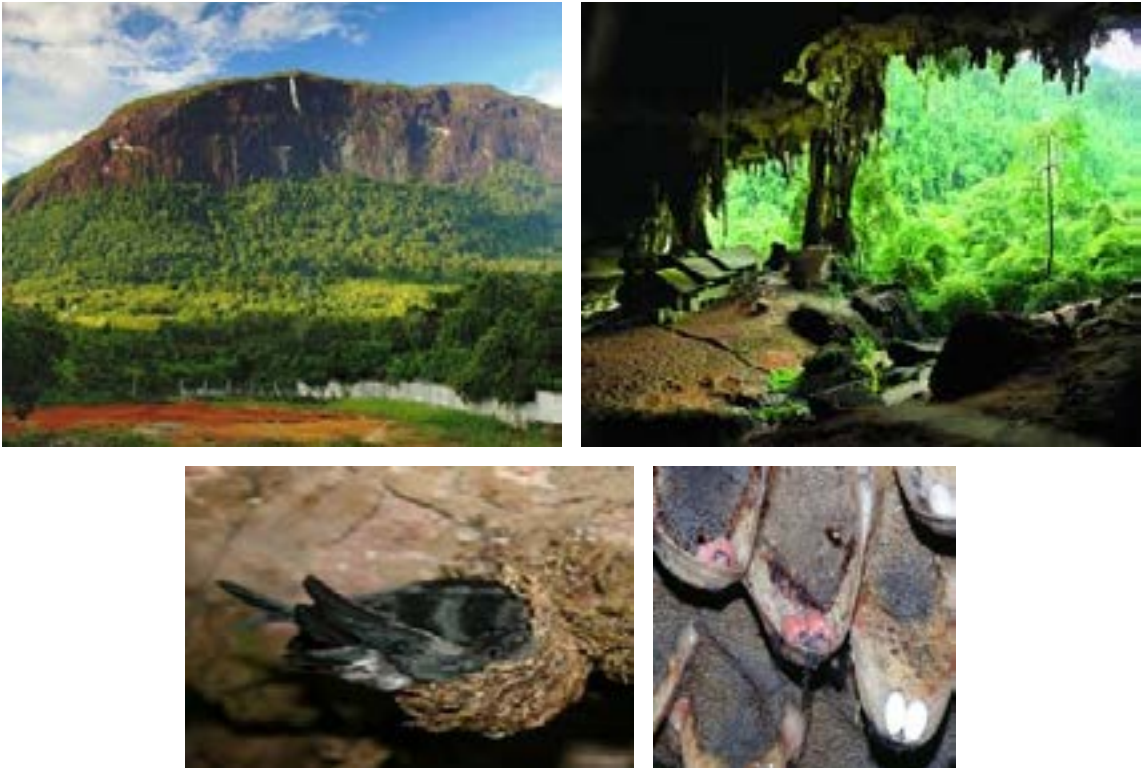
Figure 1. Edible-nest swiftlet existed naturally 48,000 years ago in caves as their natural dwellings