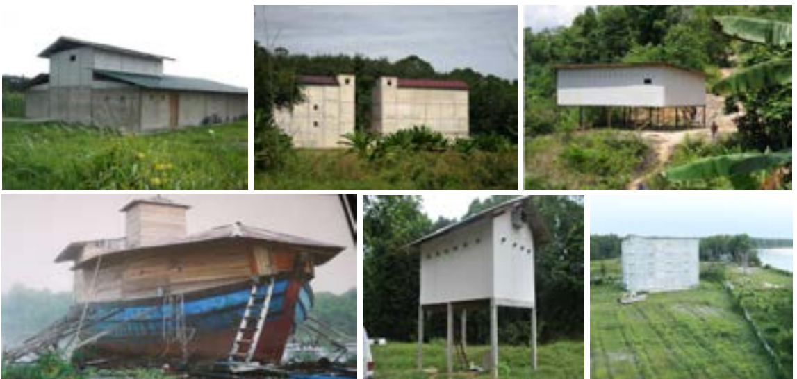
Figure 2. Different examples of types of bird's houses