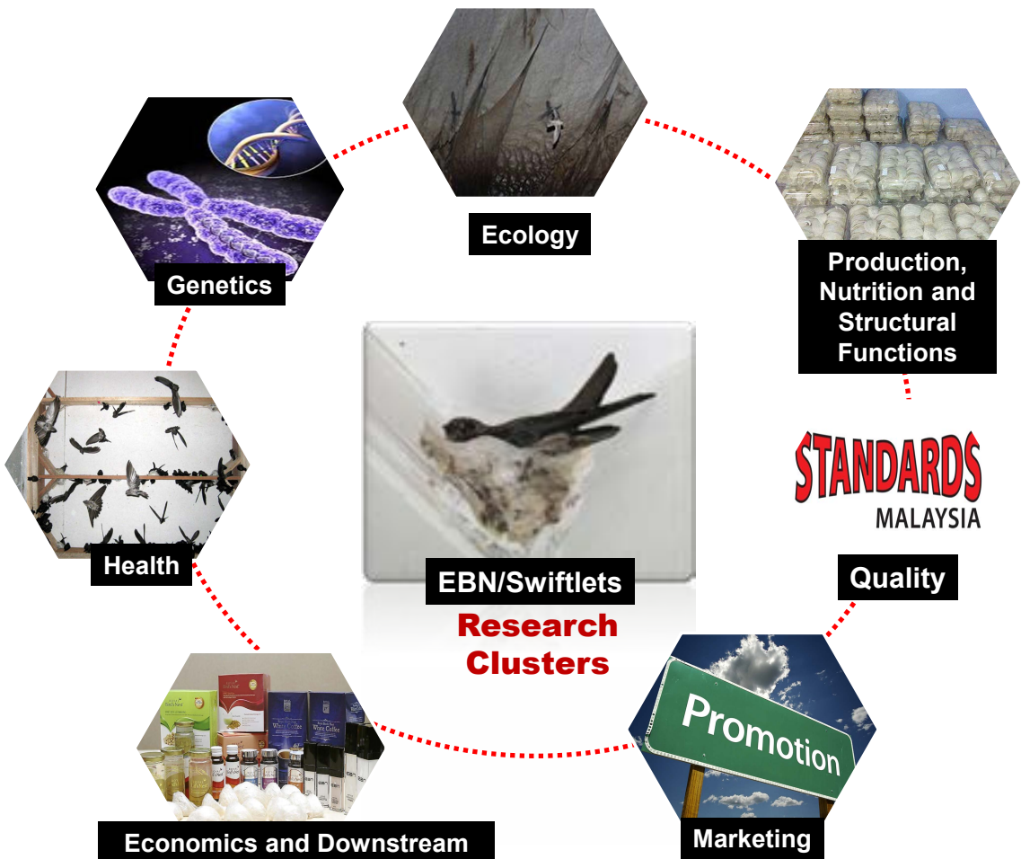
Figure 3. Research clusters in EBN Swiftlet Industry

glands as the book on the electron microscopy of the salivary glands and GIT was launch during EBNIC 2016. Thus research findings clearly can show and confirm the kind of insects that the bird was consuming (Tengku A.I and Rafiuz Z.H, 2016). The industry players are recommended to read this book because it is very interesting and informative. This is the only book available in the world talking about the ultra-structure of intestine and the salivary glands of the